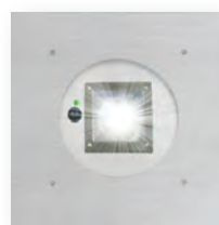
HELO F1 / F1-12 / F1-24

Helos can be integrated into your BACnet Building Automation System to enhance control and reporting and lower your total cost of ownership.