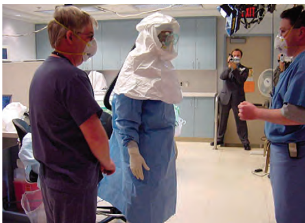
Figure 2. Healthcare worker wearing powered air-purifying respirators for demonstration.

protection against airborne diseases, even if not absolutely required for SARS, will ensure that staff are prepared to deal with future emerging infectious diseases or bioterrorism events that could involve airborne agents.